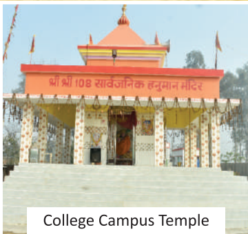
College Campus Temple