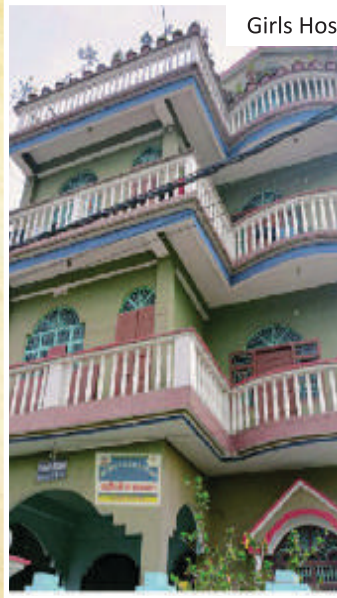
Girls Hostel.Front View