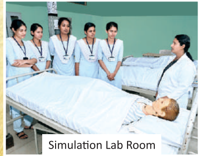
Simulation Lab Room