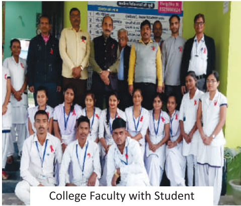
College Faculty with Student