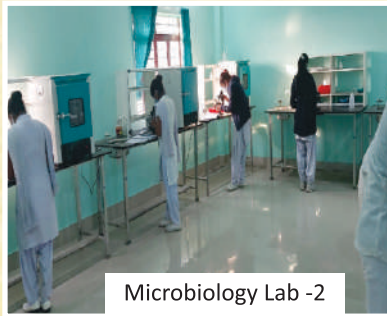
Microbiology Lab -2