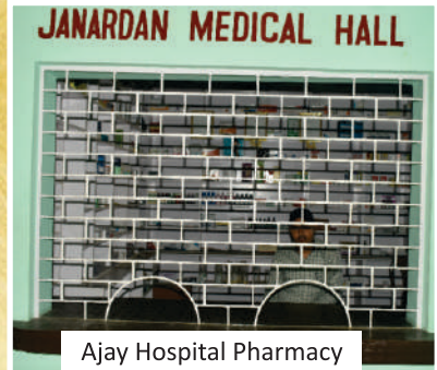
Ajay Hospital Pharmacy